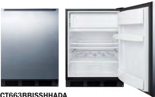
CT663BBISSHHADA 32 3/8" H x 23 5/8" W x 23 1/2" D