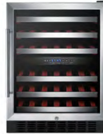
SWC530LBISTADA 32" H x 23 5/8" W x 22 3/8" D