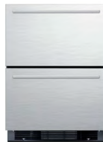
SP6DS2D7ADA 32 1/4" H x 23 5/8" W x 23 7/8" D