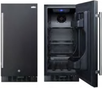
ALR15B 31 1/2" H x 14 3/4" W x 23 1/2" D