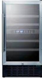
SWC182ZADA 31 3/8" H x 17 3/4" W x 23 1/2" D