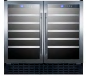
SWC3668ADA 31 1/2" H x 35 3/8" W x 23 1/2" D