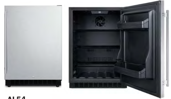
AL54 32" H x 23 5/8" W x 22 5/8" D