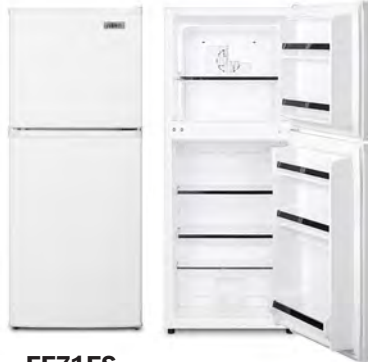
FF71ES 46" H x 18 3/4" W x 23" D