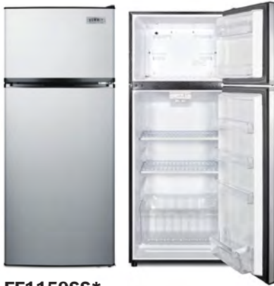
FF1159SS* 58 7/8" H x 23 5/8" W x 26" D