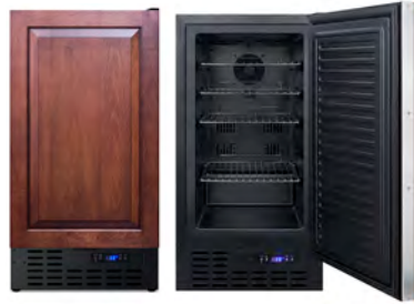
FF1843BIFADA 31 1/2" H x 17 3/4" W x 24" D