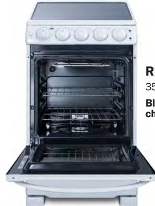
REX2051WRT 35 1/2" H x 19 3/4" W x 24 1/4" D Black and stainless steel choices also available