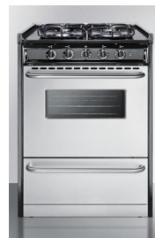
Lower Backguard TTM61027BRSW